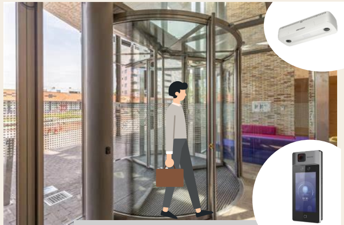
Entrance & Exit

The Solution is designed for the city hall to take fast temperature screening, flow control and mask detection in the entrance & exit and office hall to provide a safer and healthful environment.