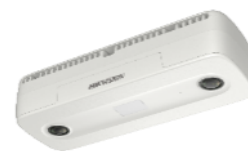
Dual-Lens People Counting Network Camera