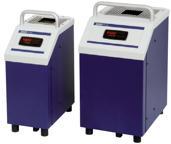
Temperature dry well calibrators, models CTD9100