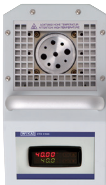
Temperature dry well calibrator, model CTD9100-450

These calibrators work with Peltier elements and can therefore reach test temperatures below ambient temperature. Due to the feature of active cooling, they are frequently used in the bio-pharmaceutical and food industries. The model CTD9100-165-X calibrator has an enlarged insert with Ø 60 mm. Thus it is possible to calibrate several temperature sensors simultaneously or to calibrate thermometers with various diameters without having to change the sleeve.