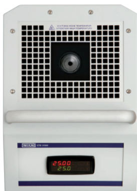
Temperature dry well calibrator, model CTD9100-165 or model CTD9100-COOL

Four instruments for the temperature range from -55 ... +650 °C