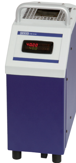
Temperature dry well calibrator CTD9100-650