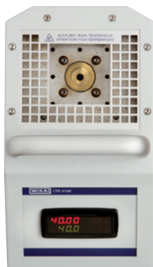
Temperature dry well calibrator, model CTD9100-650

The CTD9100-450 is used in the medium temperature range up to 450 °C. It generates its temperature with resistive electrical heating and features an enlarged insert with Ø 60 mm. Thus it is possible to calibrate several temperature sensors simultaneously or to calibrate thermometers with various diameters without having to change the sleeve.